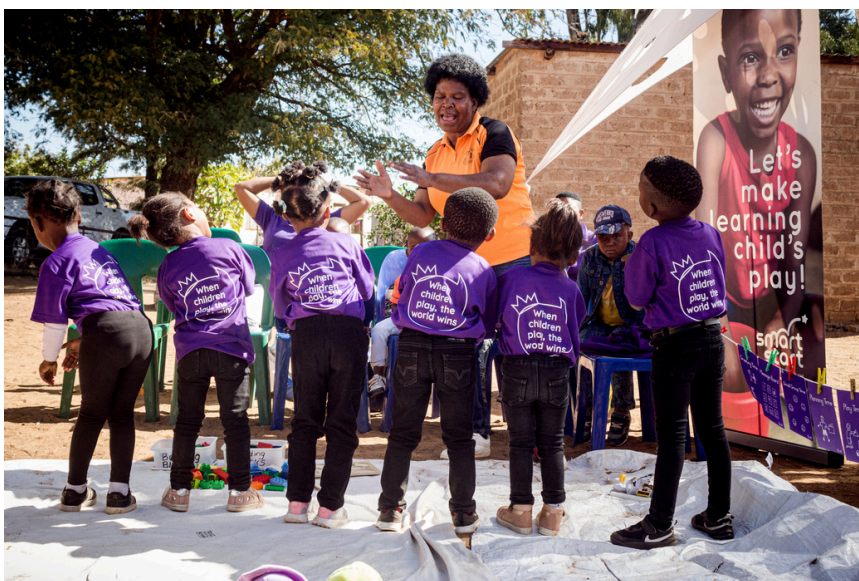
SmartStart's network of practitioners play an important role in driving the implementation of early learning programmes in their communities nationwide. These individuals are the real heroes of the day

SmartStart was seeded by several private funders in South Africa, in collaboration with the South African government. The model draws on the marketing and systems of commercial franchising to build a delivery platform for ECD across all nine provinces of South Africa. SmartStart works through nonprofit partners (operating partners/franchisors) who recruit, train, and support ECD centre owners (franchisees) to run successful small businesses. ECD centre owners are trained and licensed to deliver high quality, low cost ECD services, and supported to register their centres in order to receive government subsidies. In nearly ten years, SmartStart has grown to encompass a network of 13 franchisors (and 3 branches) and more than 10K ECD centre owners, serving more than 80K children weekly.