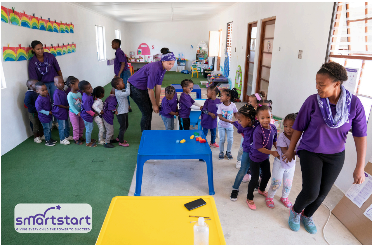
SmartStart Classroom Activity in De Doorns, Western Cape